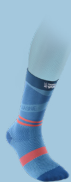
Activ mid socks Recommended retail price €29,95