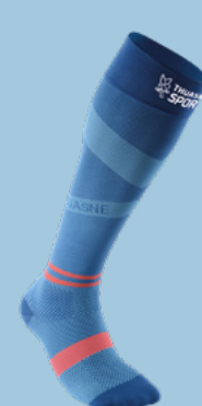
Activ long socks Recommended retail price €49,95

For further information, click here to see the press release for the new compression range.