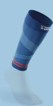
Activ calf sleeves Recommended retail price €39,95