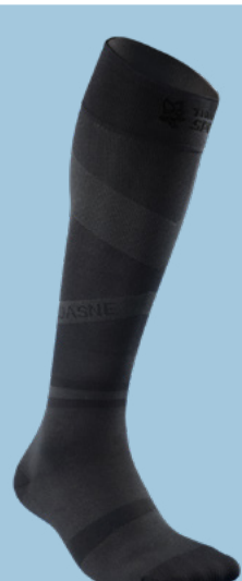
Recovery socks Recommended retail price €49,95