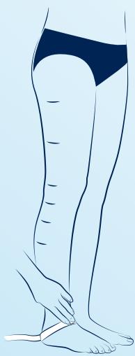
Circumference at the instep