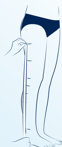
Height measurement (position of measuring tape on the external face of the leg)