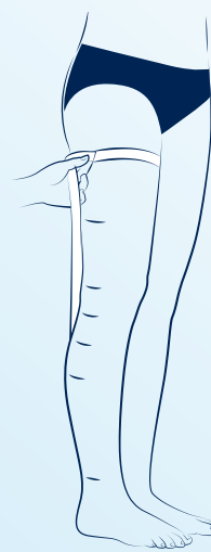
Circumference of the thigh (at the gluteal fold)